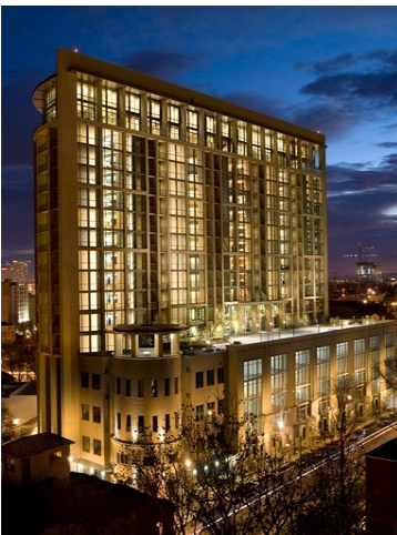
The Adelia in Midtown Nashville

Conveniently located in Midtown Nashville between Vanderbilt University and Music Row, in the perfect blend of nature, urban living and convenience, the Adelia is an 18 story mixed use community. The tower contains 186 luxury condominiums, from the brownstone inspired townhouses on ground level to large penthouse suites.