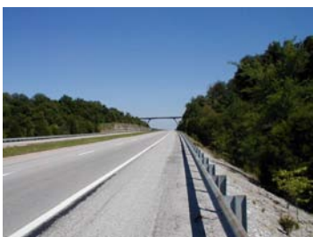
Green River Parkway