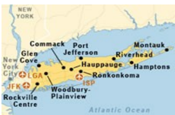
Long Island, New York — Our home for over sixty years.

Even with falling property values, school districts across Long Island are asking to increase property taxes. But Newsday pointed out in an article May 15, 2009 that these incongruous increases do not address the coming crisis. “But keep in