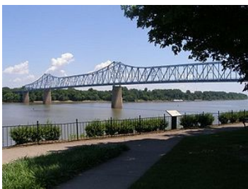
Ohio River — Owensboro, KY