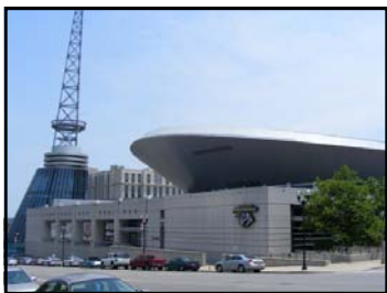
The Sommet Center — Nashville, Tennessee

Sommet Center is an all-purpose venue in downtown Nashville, Tennessee, that was completed in 1996.