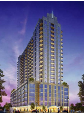
The Encore - located in the heart of downtown Nashville.

It's more than a condominium. It's an attitude. It's a statement about you and about how the world looks at you. It's freedom. It's empowerment. It's about living a fabulous life. Encore is downtown. In SoBro. New. Cool. Alive 24/7. One beautiful building across from the new Schermerhorn Symphony Center. 20 stories high. So you can see where you've been and where you're going. Encore is about lifestyle and space.