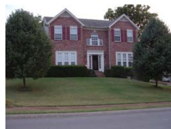
Our new home in Hendersonville where we have lived since 2005 and wish we had raised our family.

Our property taxes of $2K get us an excellent school system, with new modern facilities, a 92 member local Police Department, a 103 member paid full time Fire Department, numerous well maintained city parks and