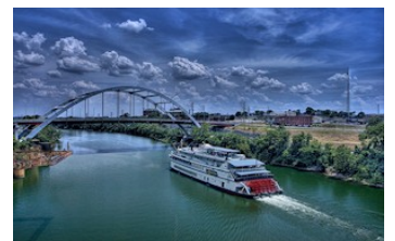
The General Jackson cruises the Cumberland River near Nashville, Tennessee

Electric rates for Cumberland Electric are less than half per kilowatt hour than those charged by the Long Island Power Authority.