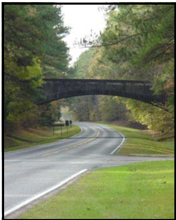
An overpass on the Natchez Trace Parkway—Nashville to Natchez.

Begun in 1938, the Natchez Trace Parkway's entrance lies only a few hundred yards from the Loveless Café and the Parkway is visited by many each year. The parkway had its completion ceremony on May 21, 2005, and now runs the full 445 miles beginning just southwest of Nashville.