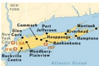
Long Island, New York — Our home for over sixty years.

This headline from an article in Newsday on April 26, 2009 reported: